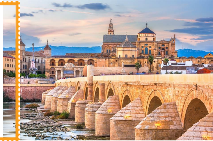
Day 7: Onto Granada. Enroute,

visit Cordoba with a local guide. Visit Mezquita.