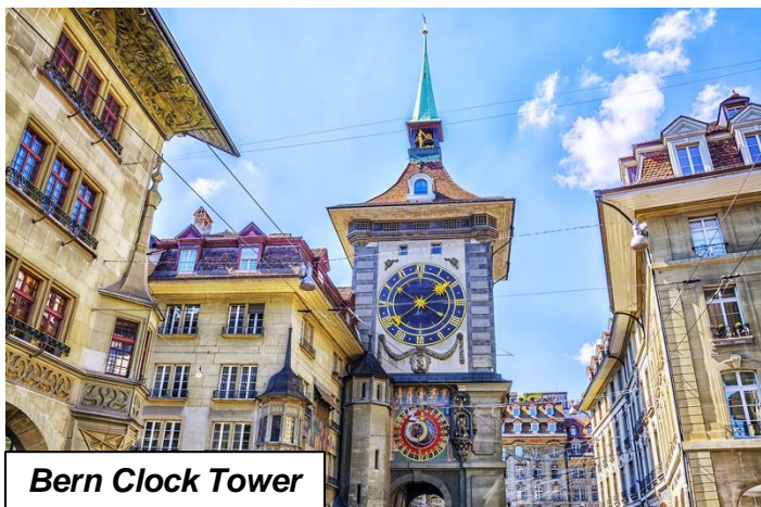
Bern Clock Tower

Visit Olympic Museum at Lausanne. Visit Gruyère Cheese Farm. Orientation tour of Bern.