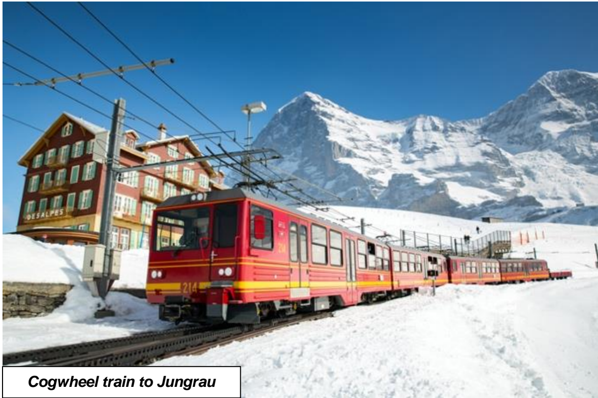
Cogwheel train to Jungfrau