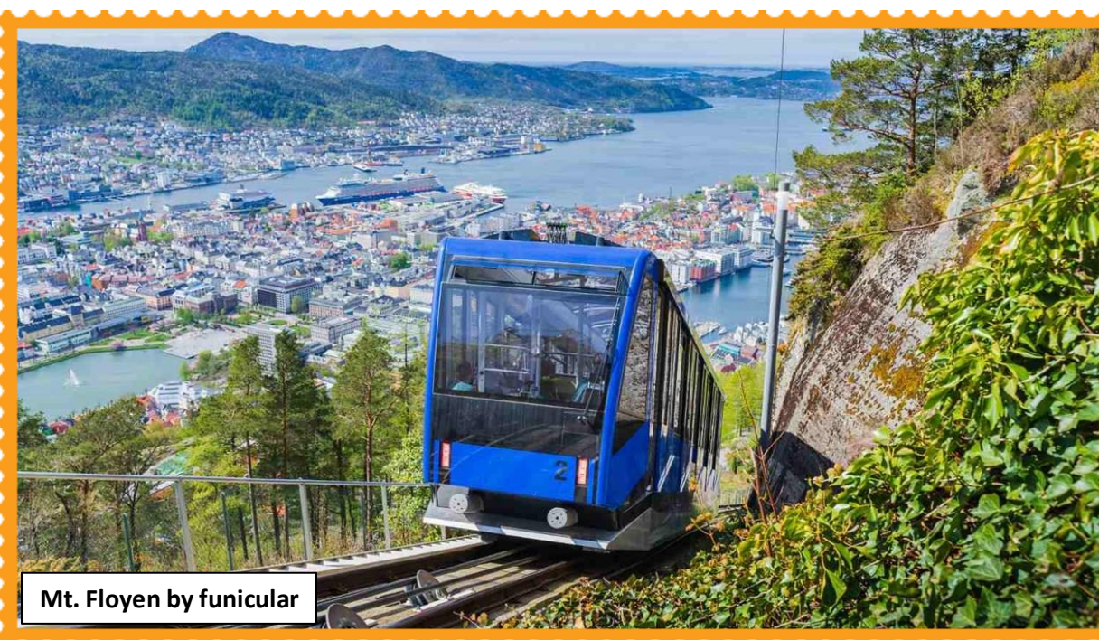
Mt. Floyen by funicular

Overnight on board the Fjordline Cruise. (Breakfast, Lunch, Western Dinner)