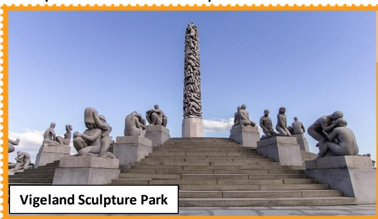
Vigeland Sculpture Park

Enjoy a guided city tour of Oslo with Museum of Cultural History, Vigeland sculpture Park & visit to the top of Holmenkollen Ski Jump.