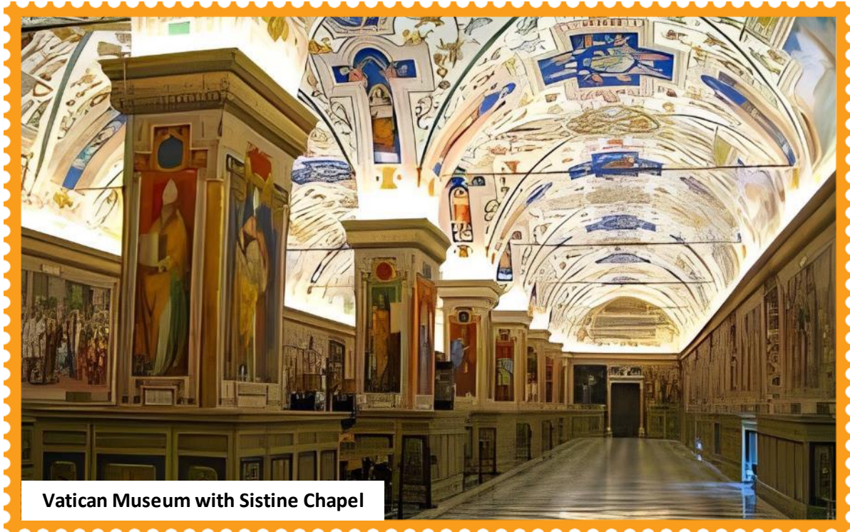
Vatican Museum with Sistine Chapel

by historic cafes and dominated by the magnificent Palazzo Vecchio. We'll also take in the renowned Ponte Vecchio, a bridge that spans the River Arno. Following this captivating experience, we'll proceed towards Pisa. Upon arrival, you'll be treated to a view of the Square of Miracles, home to the astounding Leaning Tower of Pisa—a sight that never fails to leave a lasting impression.