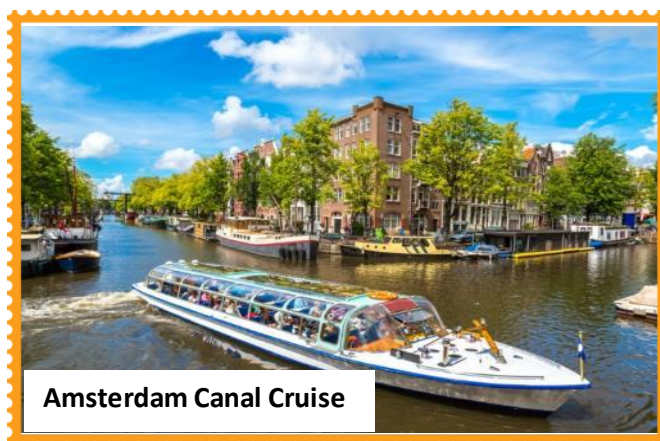
Amsterdam Canal Cruise

Visit Keukenhof Gardens (till 11th May). Visit picturesque Dutch Village of Windmills and Tradition (from 12 th May). Explore Amsterdam with Canal Cruise.