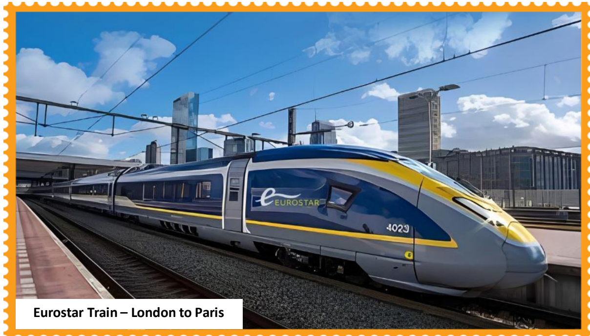
Eurostar Train – London to Paris