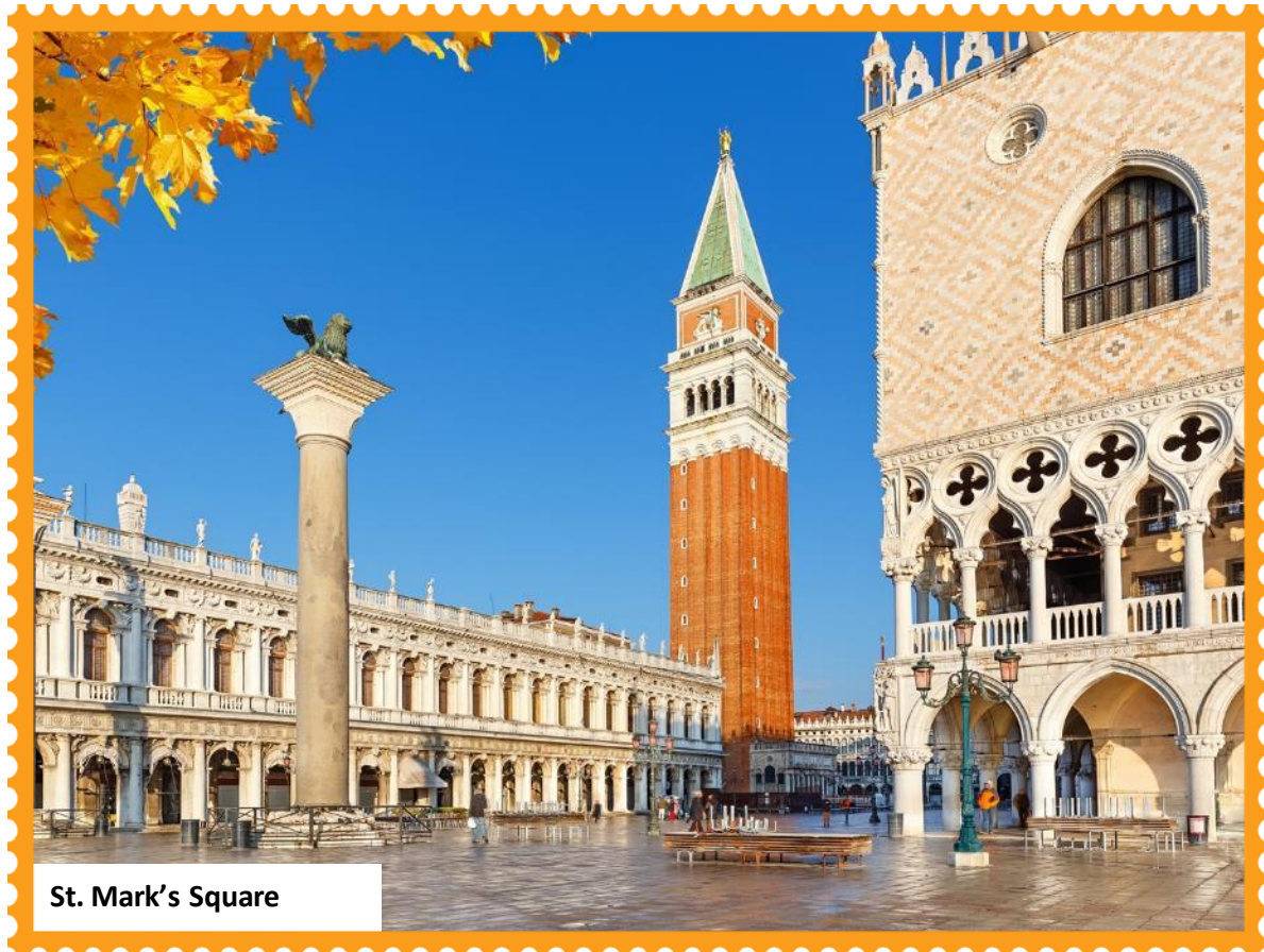
St. Mark's Square

Overnight stay at the hotel in Innsbruck / Seefeld. (Breakfast, Lunch, Dinner)