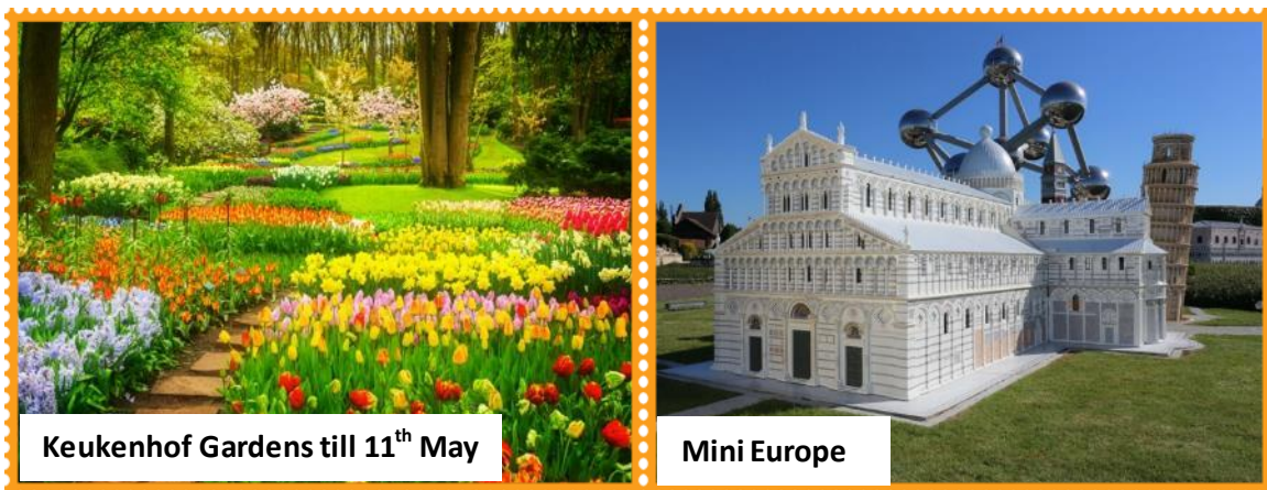
Keukenhof Gardens till 11 th May

(Important Note – Keeping in mind the logistical consideration the Tour Manager reserves the right to alter or change the itinerary. However, we will ensure that all the attractions are covered)