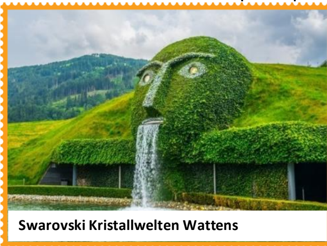
Swarovski Kristallwelten Wattens

Drive to Vaduz, the capital at the Principality of Liechtenstein with a guided mini train ride. Visit Swarovski Crystal Museum – the dazzling world of crystals. Visit Innsbruck – The Tyrolean capital of picturesque Austria.