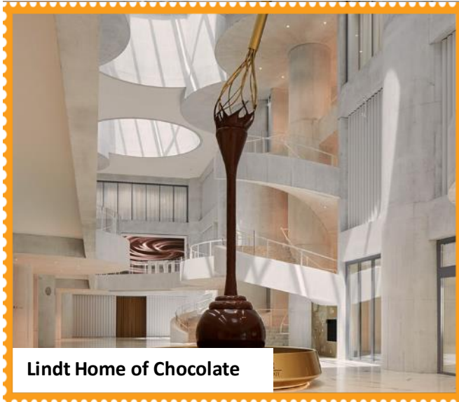
Lindt Home of Chocolate

Our journey continues to Engelberg, where you'll be treated to breath taking scenery and a once-in-a-lifetime experience. We'll embark on an exhilarating trip to the summit of Mt. Titlis, reaching