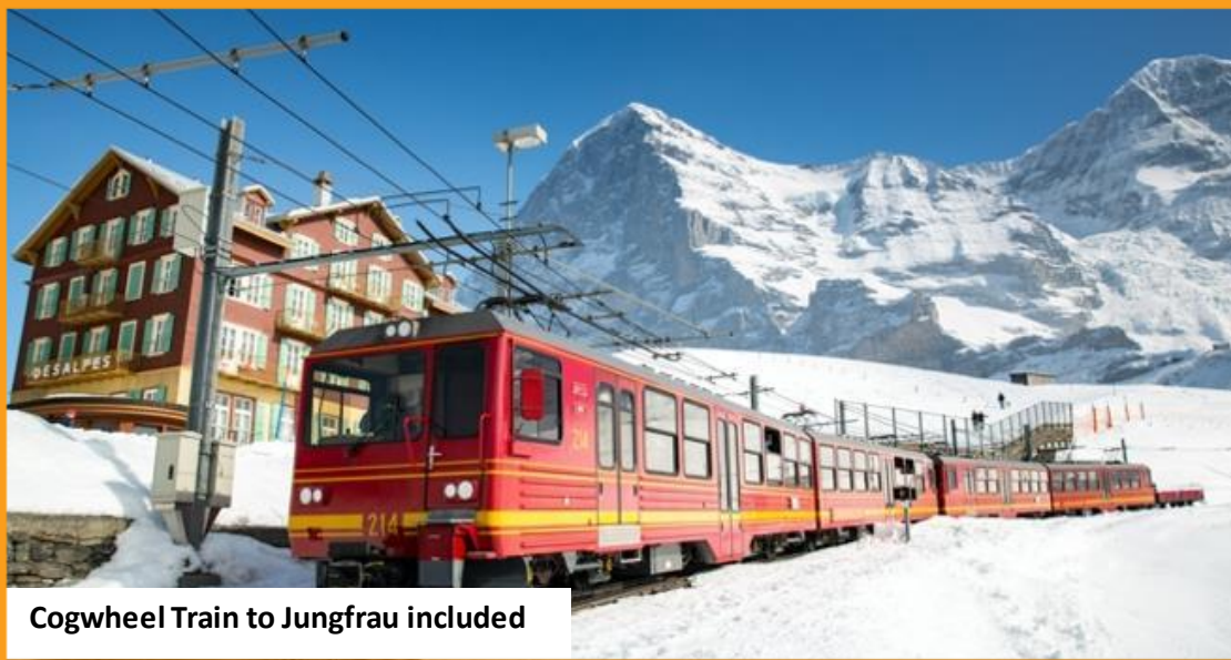
Cogwheel Train to Jungfrau included

Upon arrival, you'll find yourself in a realm of eternal ice and snow, where natural beauty knows no bounds. Explore the enchanting Ice Palace, where skilled artists craft their masterpieces from ice.