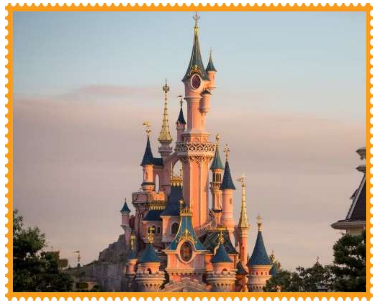
Disneyland Paris Day 5

Indulge in a day of excitement at Disneyland<sup>®</sup> Paris, where you have the choice of exploring either Disney<sup>®</sup> Park or Walt Disney Studios<sup>®</sup> Park. Enjoy a romantic cruise along the picturesque Seine River. Paris by Night Tour.