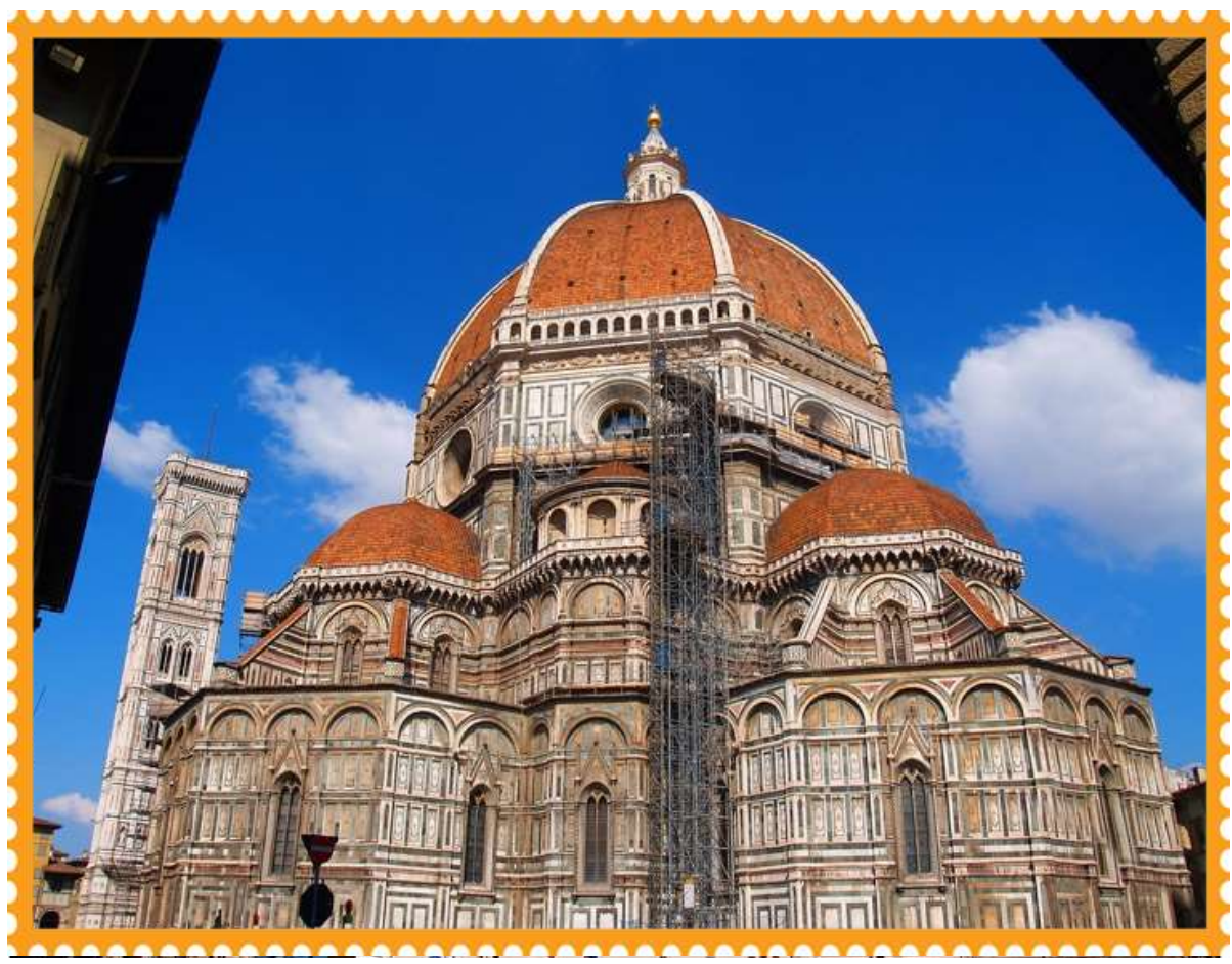
Basilica Di Santa Croce Day 13 Guided city tour of Florence. View the Duomo – Florence most

To truly embrace the enchantment of Venice, we'll treat you to a romantic gondola ride in a flatbottomed Venetian rowing boat. Glide through the city's canals, surrounded by the stunning backdrop of baroque buildings —an experience that encapsulates the essence of this captivating city. Following our adventures, we'll return to the pier and proceed to check in at your hotel. Overnight in Padova/Bologna. (Breakfast, Lunch, Dinner)