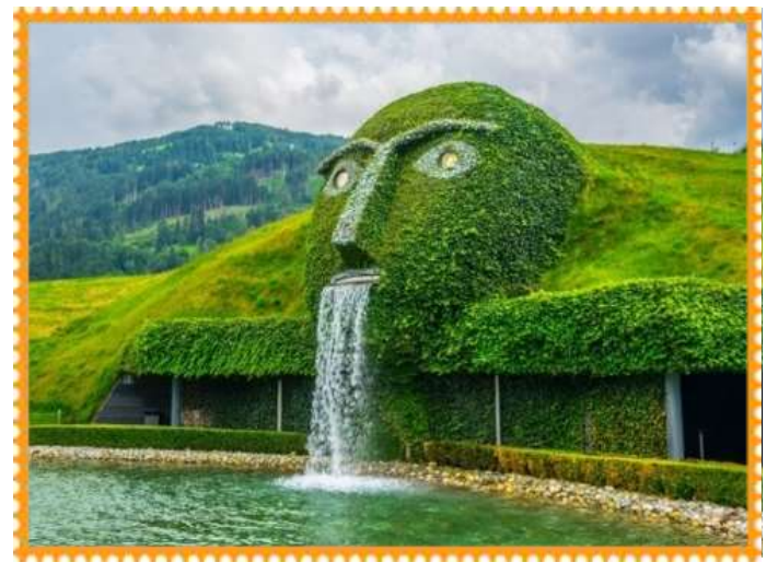
Swarovski Kristallwelten Wattens

Drive to Vaduz, the capital at the Principality of Liechtenstein with a guided mini train ride. Visit Swarovski Crystal Museum – the dazzling world of crystals. Visit Innsbruck – The Tyrolean capital of picturesque Austria.