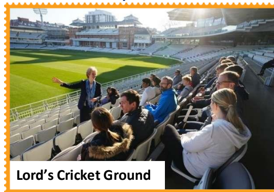
Lord's Cricket Ground

Post breakfast, we drive to explore the city of London with our expert local guide. You will see important landmarks like the Big Ben, Houses of Parliament, Westminster Abbey, Trafalgar Square, Piccadilly Circus, Tower Bridge, River Thames, Hyde Park and many more. Witness the Changing of the Guards at Buckingham Palace (subject to operation). Next, we proceed to visit the renowned Madame Tussauds wax museum. Be enthralled by the world's largest wax collection of famous personalities. Later, visit one of the iconic cricketing venues in London – the Lord's Cricket Ground. In Lord's you will have an opportunity to go behind the scenes at the 'Home of Cricket', and to experience some of the most inspiring views in sport. See the iconic parts of the ground including the Grade II*-listed Victorian Pavilion, the world-famous Long Room, the Players' Dressing Rooms, and the MCC Museum, home of the Ashes Urn – cricket's best-known artefact. Later we visit London eye, one of the many iconic highlights of the city. Enjoy scenic views of the city while you ride the London eye. It is one of the most popular tourist attractions in the United Kingdom, standing at 135 meters tall overlooking the river Thames and the beautiful city of London.