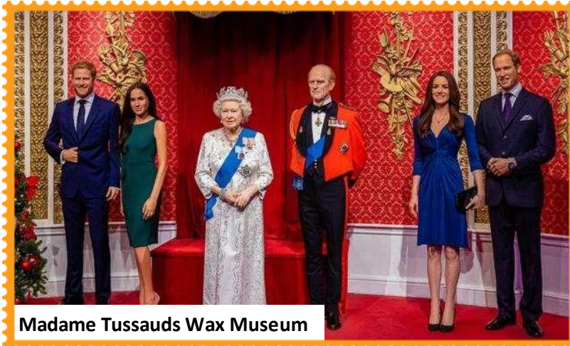
Madame Tussauds Wax Museum

Visit Windsor Castle. Drive to Stratford-upon-Avon. Onto Manchester.