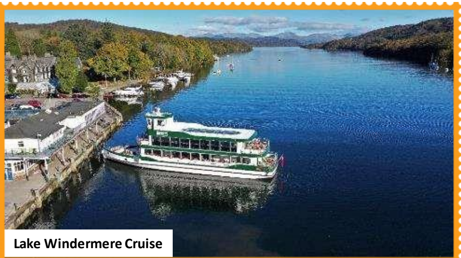
Lake Windermere Cruise

On this day, we check out and embark on a journey to visit the tranquil Lake District - one of the finest of England's National Park. Enjoy the Windermere Lake Cruise - the most popular attraction in Cumbria. Windermere is England's largest lake, in the heart of the Lake District. Thereafter, we head towards Scottish