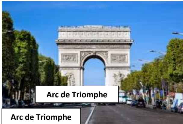
Arc de Triomphe