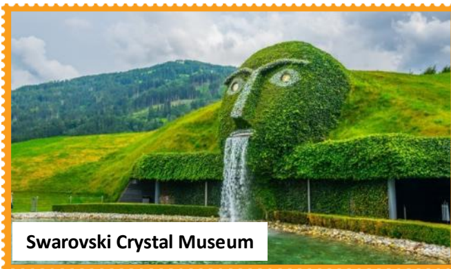
Swarovski Crystal Museum

Visit the magnificent Rhine Falls. Visit Swarovski Crystal Museum – the dazzling world of crystals. Visit Innsbruck – The Tyrolean capital of picturesque Austria.