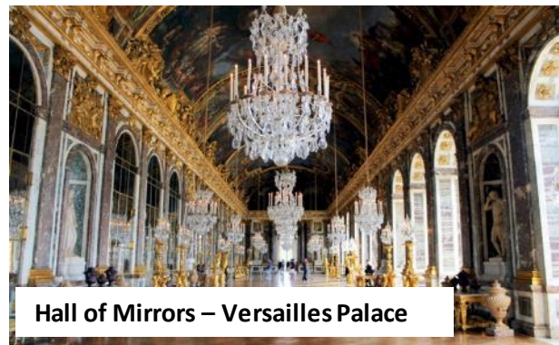
Hall of Mirrors – Versailles Palace

acclaimed masterpiece located in Versailles, approximately 12 miles (19 km) west of Paris, France. This magnificent palace is the property of the French Republic and has been under the stewardship of the Public Establishment of the Palace, Museum, and National Estate of Versailles, overseen by the French Ministry of Culture since 1995.