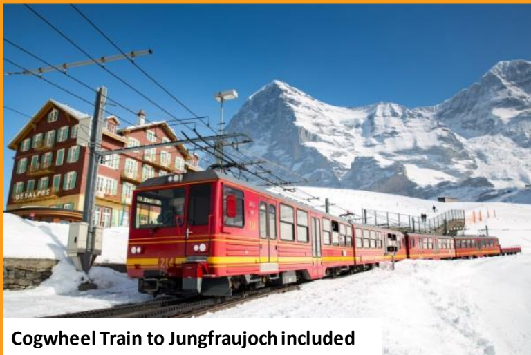
Cogwheel Train to Jungfrauoch included

Enjoy a magical alpine excursion to the top of Europe - the amazing Jungfrauoch which is included in your tour and scenic Interlaken.