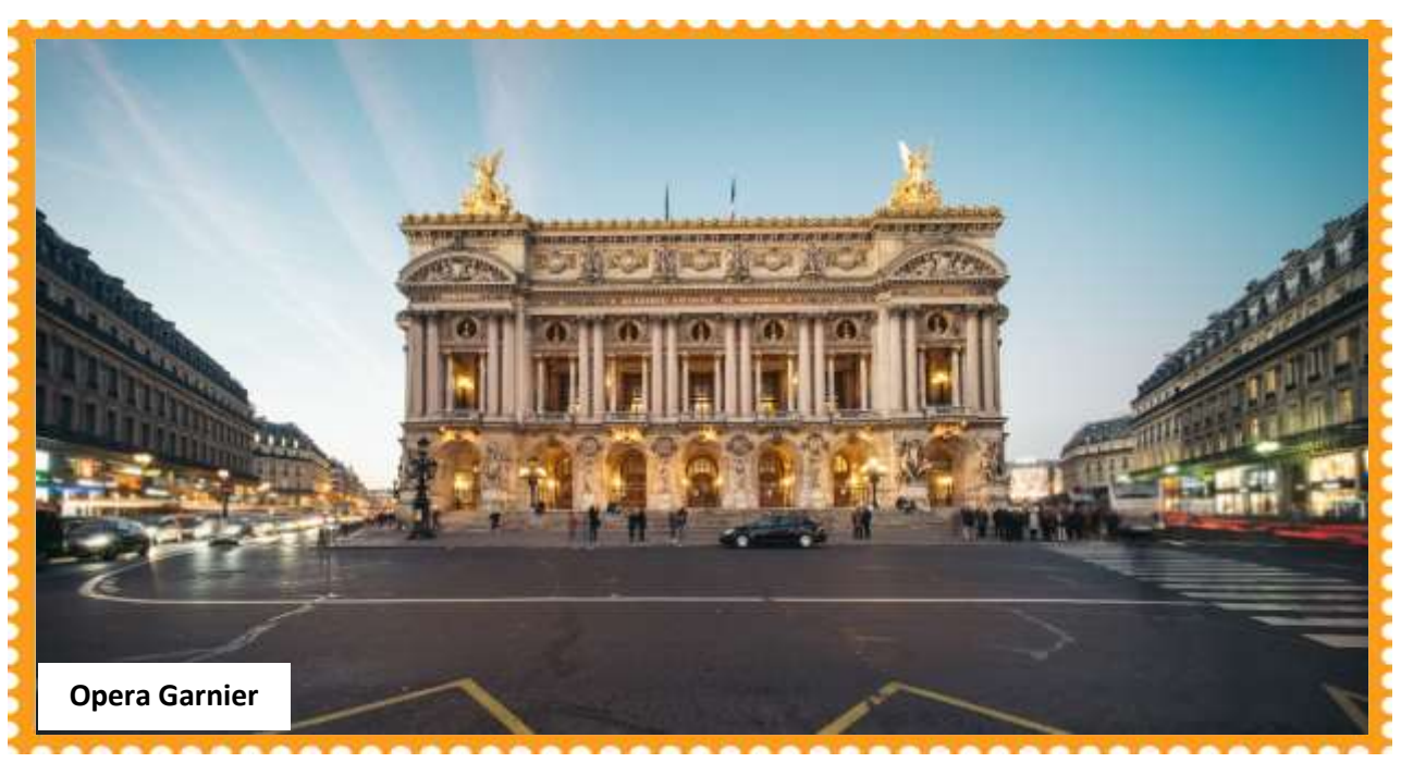
Day 1 Arrive into Paris – the City of Romance, Lights and Glamour.

Hello! Today, we begin our adventure to Paris, a renowned city known for its exceptional fashion, renowned museums, breathtaking landmarks, and captivating cabaret scenes. Upon reaching