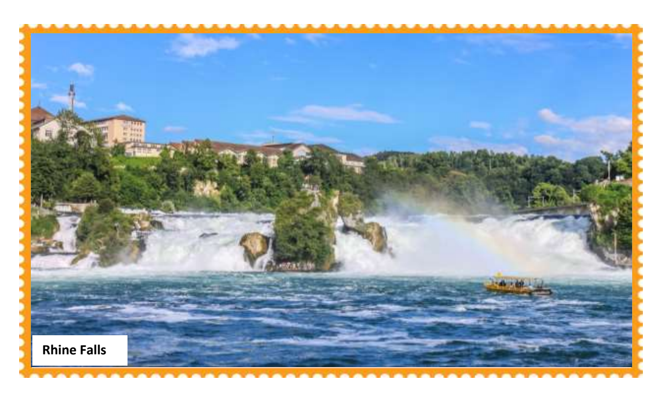
Day 6 See the largest Waterfall in Switzerland - The Rhine Falls. Visit Swarovski Crystal Museum. Orientation tour of Innsbruck.

Overnight in Central Switzerland. (Breakfast, Lunch, Dinner)