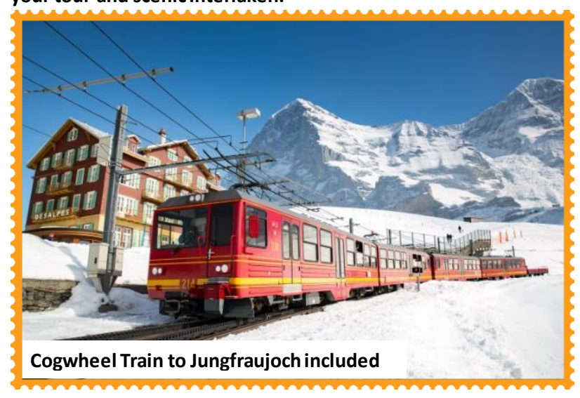
Day 4 Enjoy a magical alpine excursion to the top of Europe - the amazing Jungfraujoch which is included in your tour and scenic Interlaken.

Get set for a memorable magical alpine excursion to Jungfraujoch -The Top of Europe, a high-point of tour. First proceed your Grindelwald Terminal. The new 3S-Bahn Eiger Express takes you from the Grindelwald Terminal to the Eigergletscher station in just 15 minutes. There you board a cogwheel train to reach the highest railway station in Europe at 11,333 feet - a world of eternal ice and snow. Visit the Ice Palace where artistes create their work of art in ice. Visit the Sphinx observatory deck to experience a breath-taking