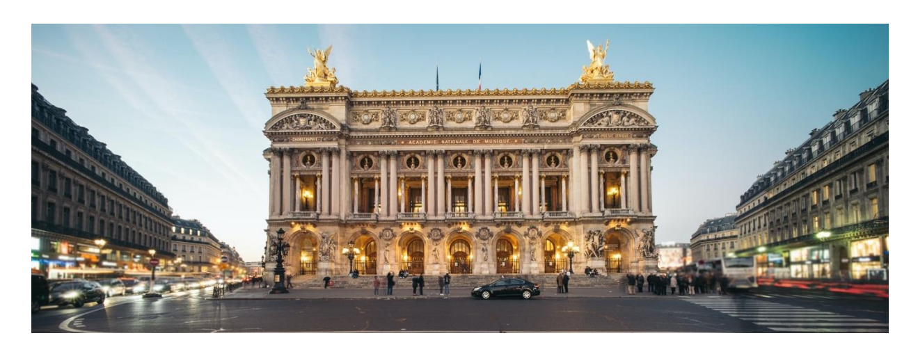
Day 1 Arrive into Paris – the City of Romance, Lights and Glamour.

Hello! Today, we begin our adventure to Paris, a renowned city known for its exceptional fashion, renowned museums, breathtaking landmarks, and captivating cabaret scenes. Upon reaching your destination, our Tour Manager will extend a warm welcome, assist you with hotel check-in, and be available to support you throughout your stay.