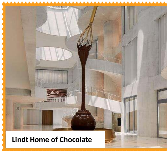
Lindt Home of Chocolate

Visit Mt. Titlis- enjoy Cable car rides including the world's first rotating cable car, the Rotair – to the top of Mt. Titlis at 3,020 metres. A brief orientation tour of Lucerne. Entrance to Switzerland's ultimate chocolate attraction – The Lindt Home of Chocolate.