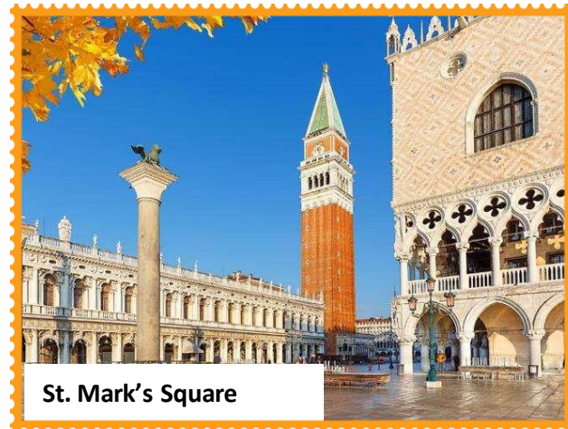
St. Mark's Square

Welcome to Venice, Italy, the captivating floating city. Immerse yourself in the enchanting experience of a gondola ride through its picturesque waterways.