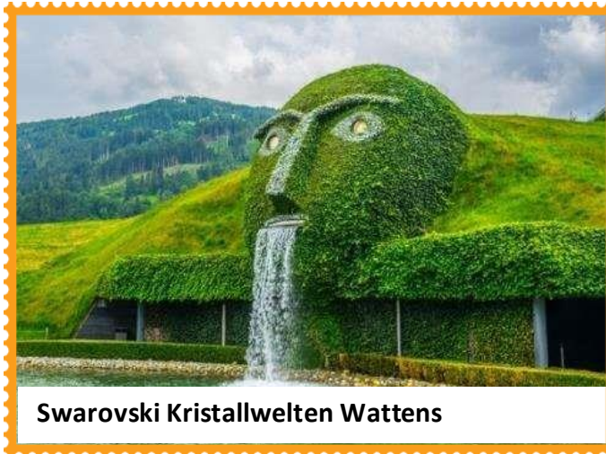
Swarovski Kristallwelten Wattens

Drive to Vaduz, the capital at the Principality of Liechtenstein with a guided mini train ride. Visit Swarovski Crystal Museum – the dazzling world of crystals. Visit Innsbruck – The Tyrolean capital of picturesque Austria.