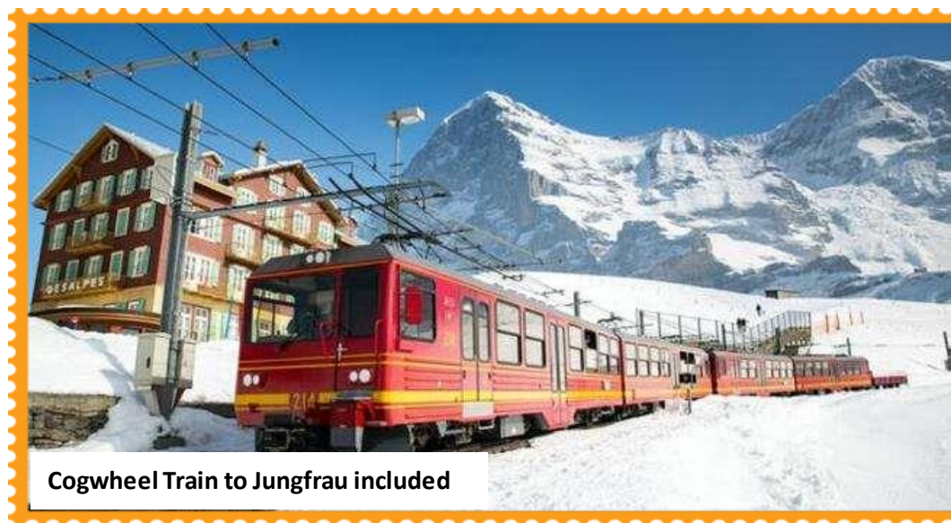
Cogwheel Train to Jungfrau included

Upon arrival, you'll find yourself in a realm of eternal ice and snow, where natural beauty knows no bounds. Explore the enchanting Ice Palace, where skilled artists craft their masterpieces from ice.