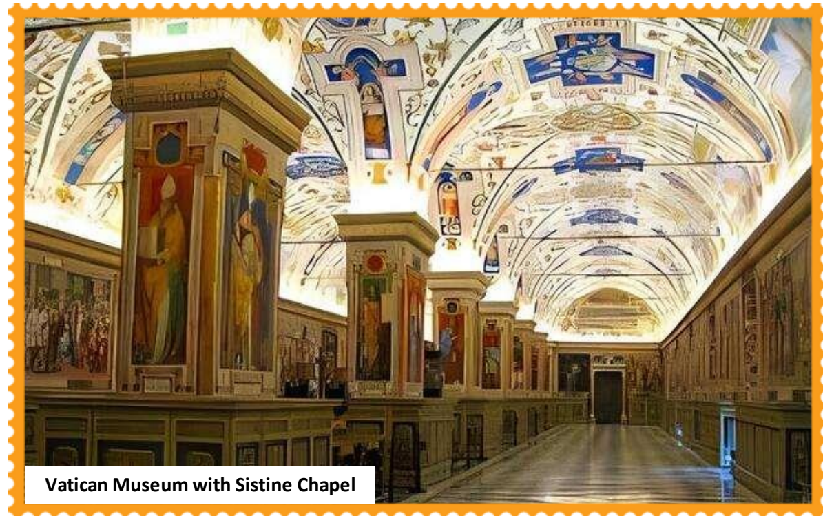
Vatican Museum with Sistine Chapel

Overnight stay at the hotel in Tuscany region. (Breakfast, Lunch, Dinner)