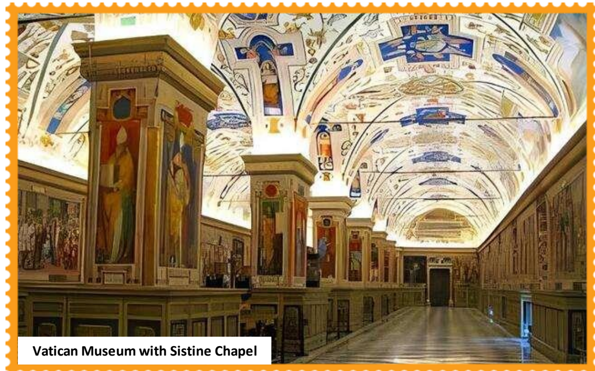
Vatican Museum with Sistine Chapel

Overnight stay at the hotel in Tuscany region. (Breakfast, Lunch, Dinner)