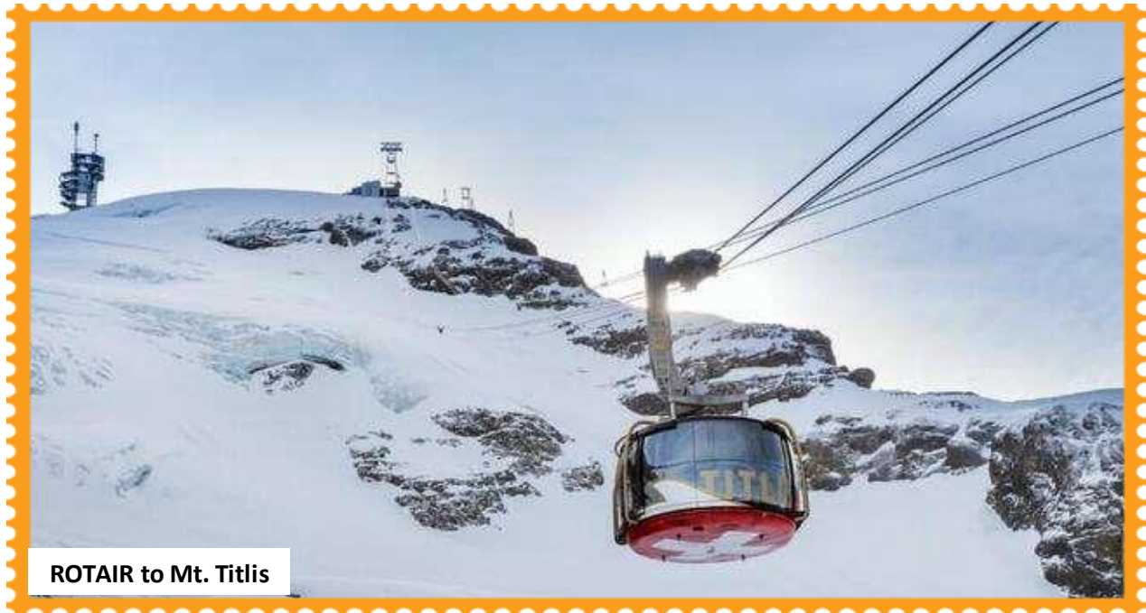
ROTAIR to Mt. Titlis